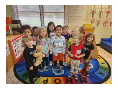
Yadkinville III classroom and teacher enjoys Wacky Tacky Day!