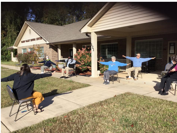
Yadkin Valley Senior Center October 19, 2020 Outdoor Exercises Class