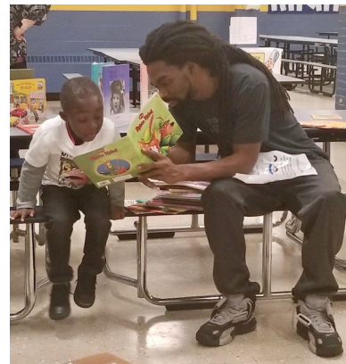
An engaged father reading to his child at the Stokes County Workshop held at London Elementary