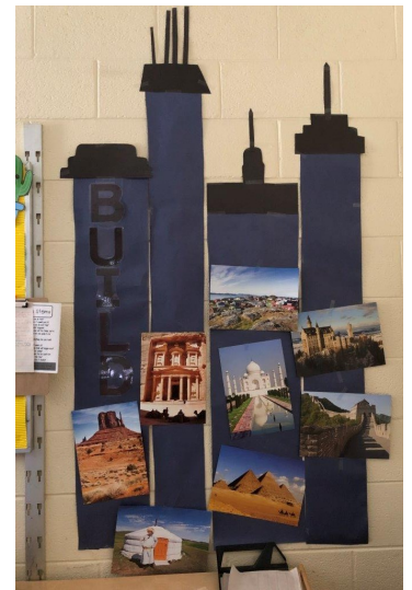
Jones1: All the buildings we can build!