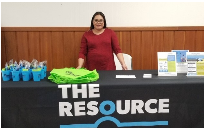
Thank you to "The Resource" for bringing information and goodies to our Parent Workshop!

Thank you to Goodwill for providing employment resources to our families!