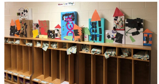
Jones 1: Welcome to our Village!