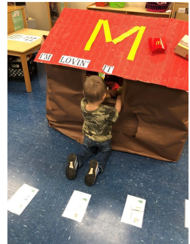
Jones 1: Can I take your order?