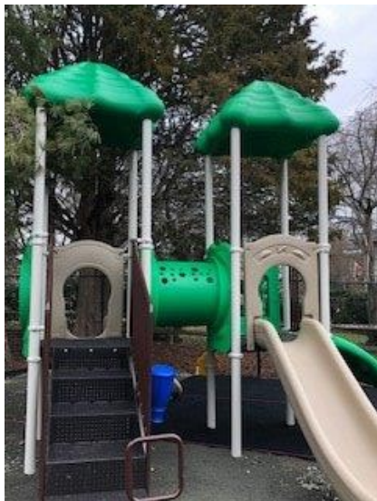
Yadkinville Head Start has a new playground!