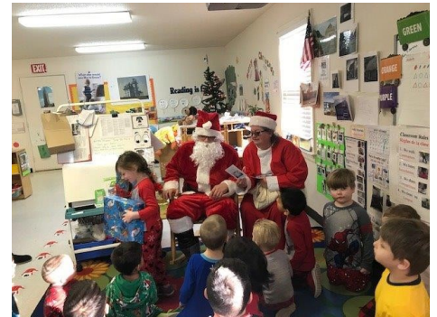
Santa Clause is coming to... PAYNEtown!!!