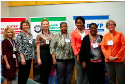
Oldest Sponsoring Organizations

Several programs were recognized for their service to Senior Corps. YVEDDI has administered the RSVP program since 1973 and was recognized for having the longest running program by the same sponsor agency.