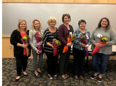
NC Senior Corps Training - Planning Committee