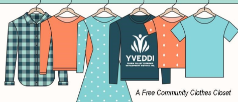
A Free Community Clothes Closet