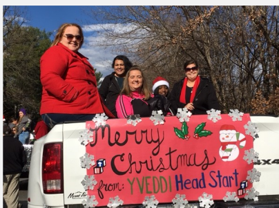
YVEDDI Head Start participating in the Mount Airy Christmas Parade on November 25th